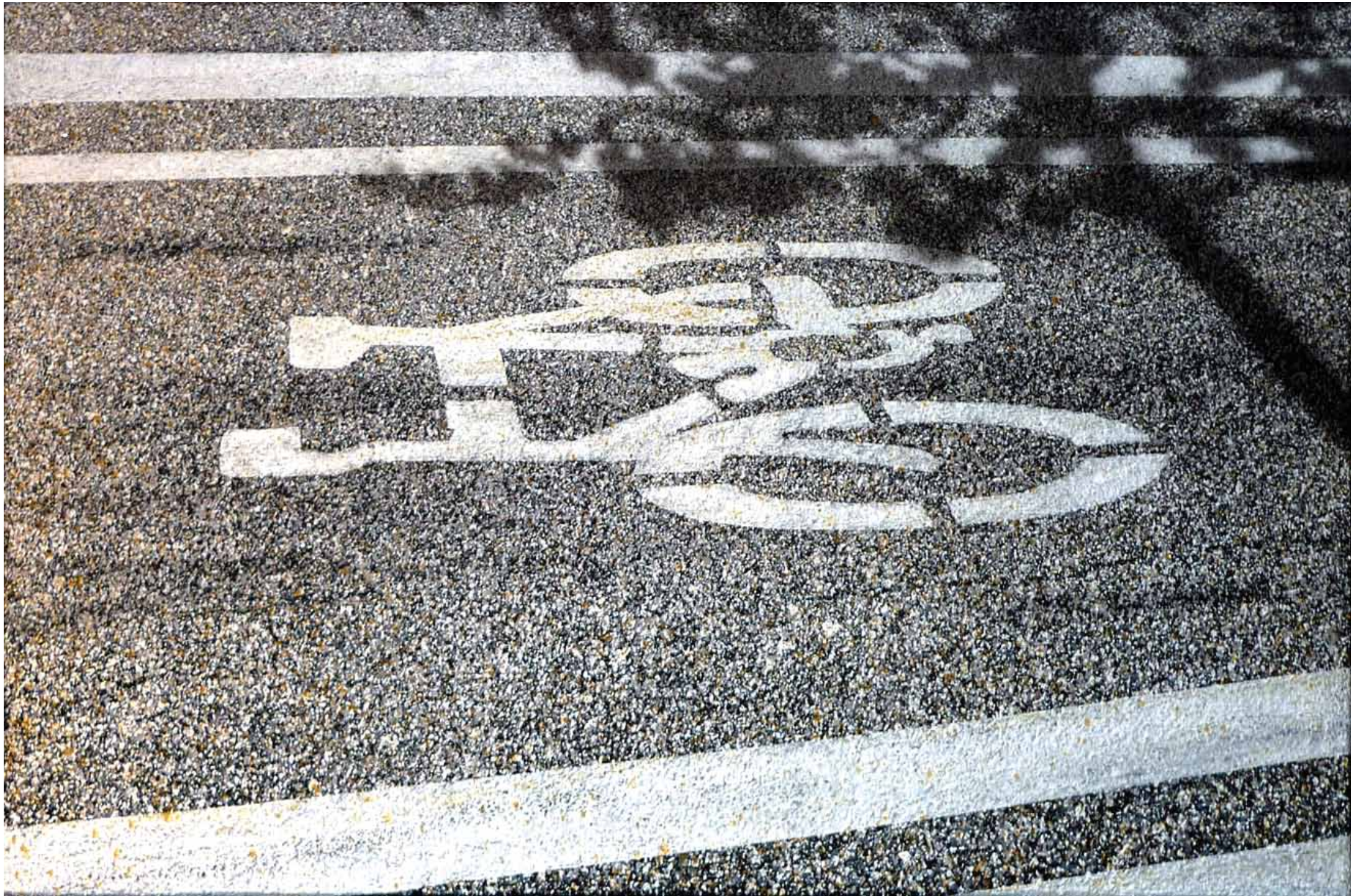
tree shadow on bike lane