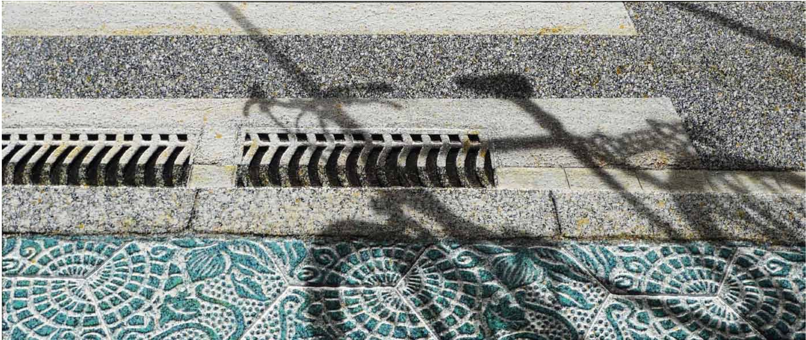
cycle shadow 24 x 57" • mixed media on canvas