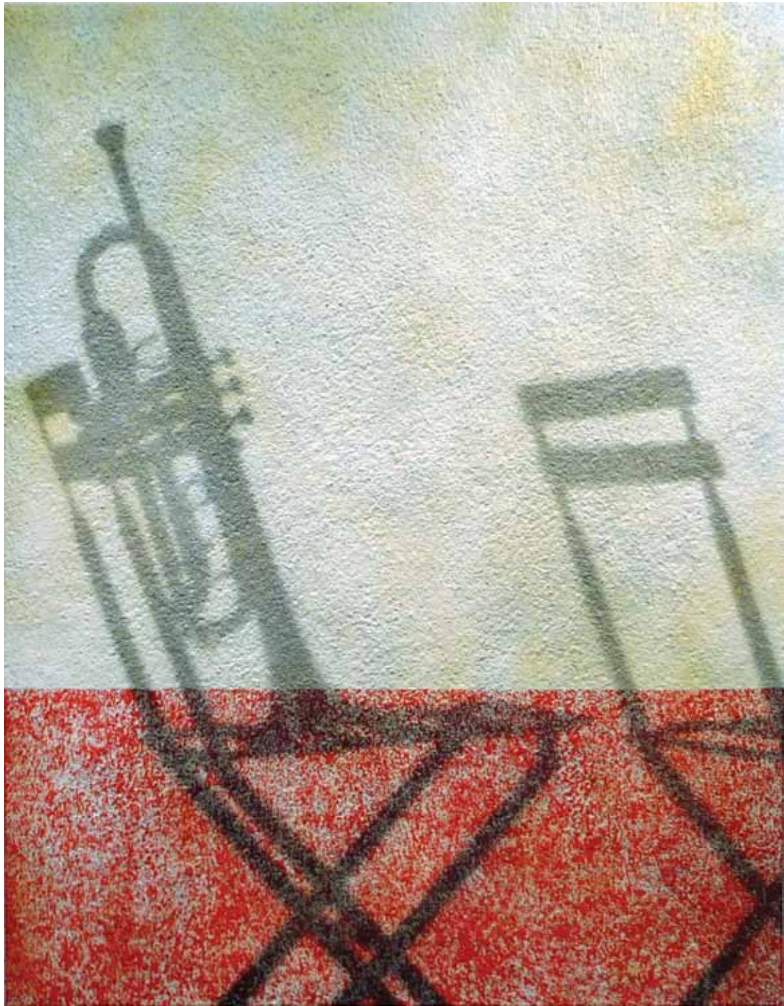
trumpet and chairs 46 x 35" • mixed media on canvas