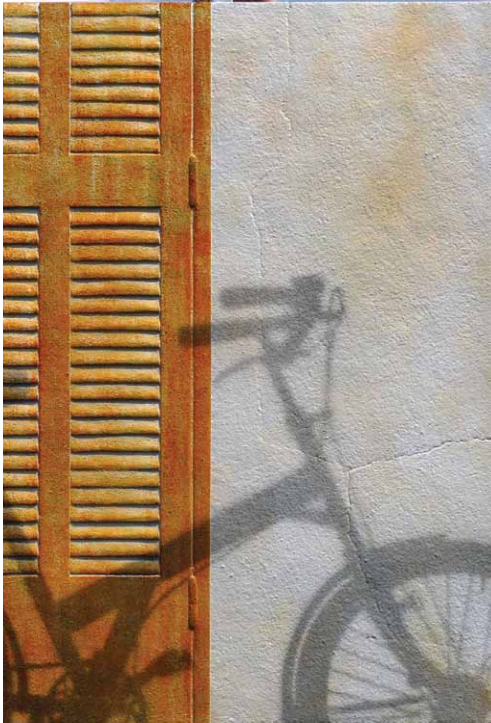
standing beside ochre door