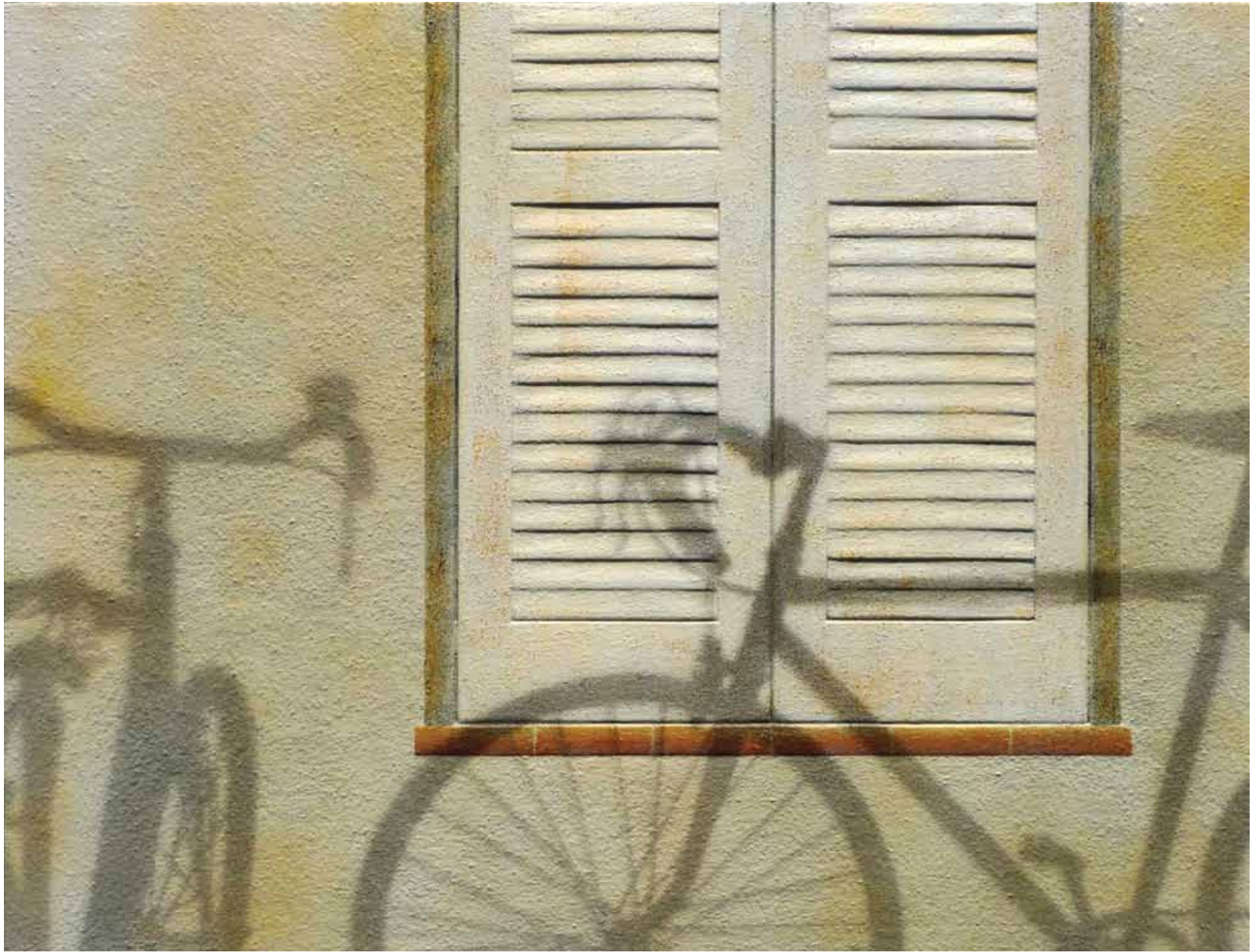
two cycles standing 45 x 57" • mixed media on canvas