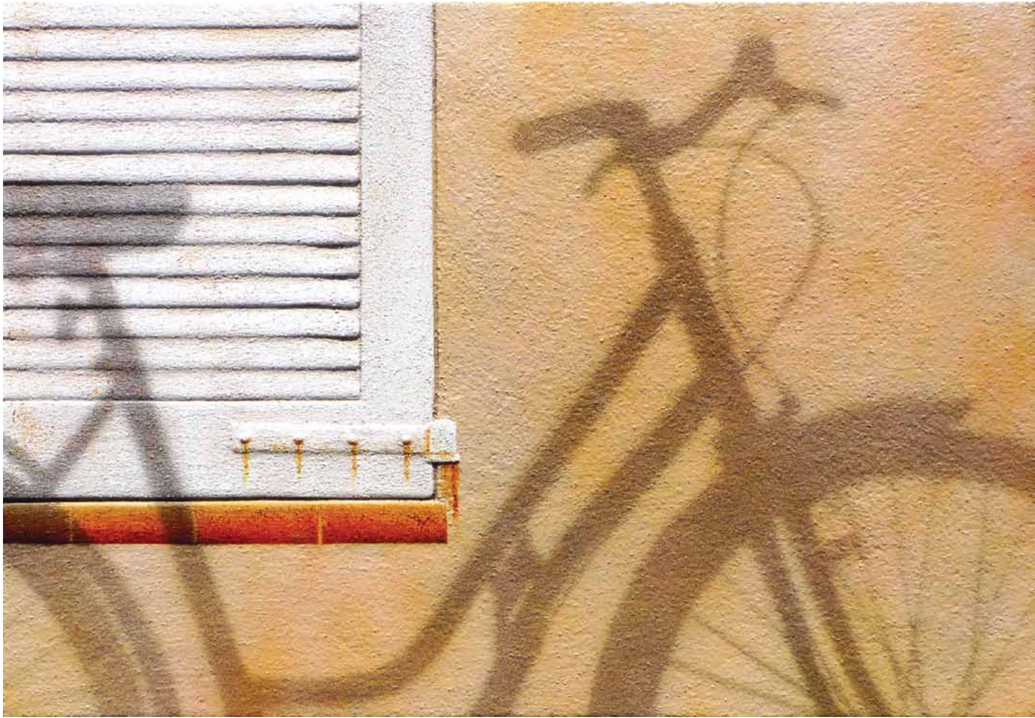
summertime 32 x 46" • mixed media on canvas