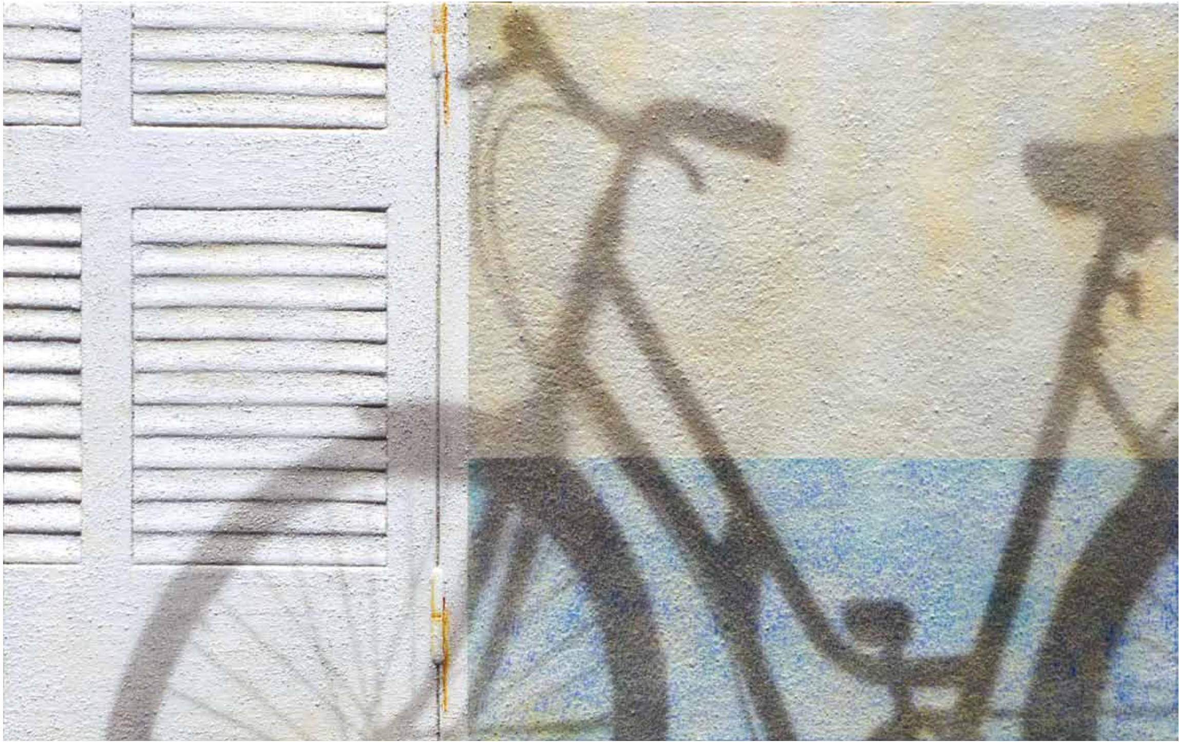
bicycle below sun 32 x 57" • mixed media on canvas