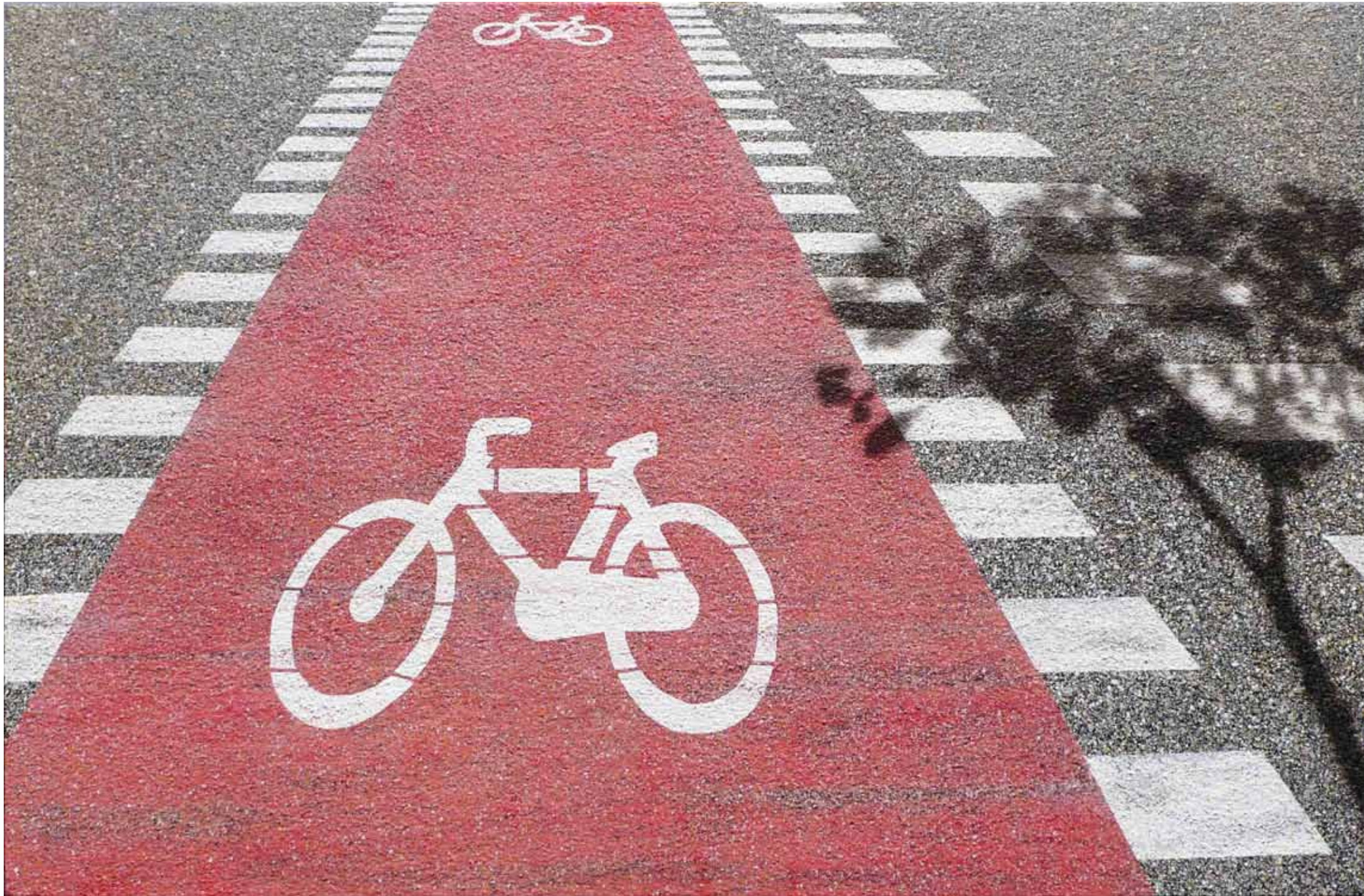
red bike lane 38 x 57" • mixed media on canvas