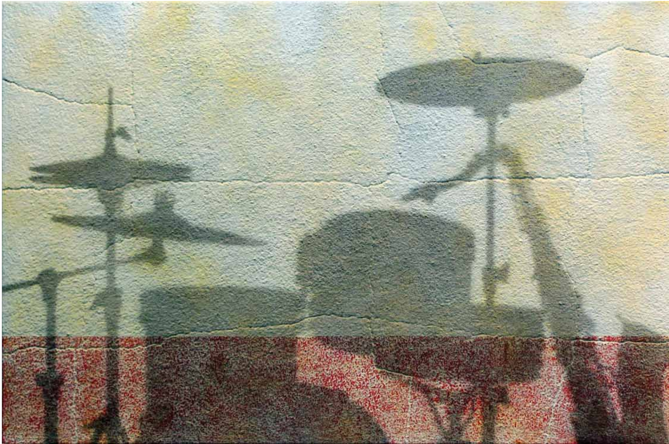
drums and saxophone