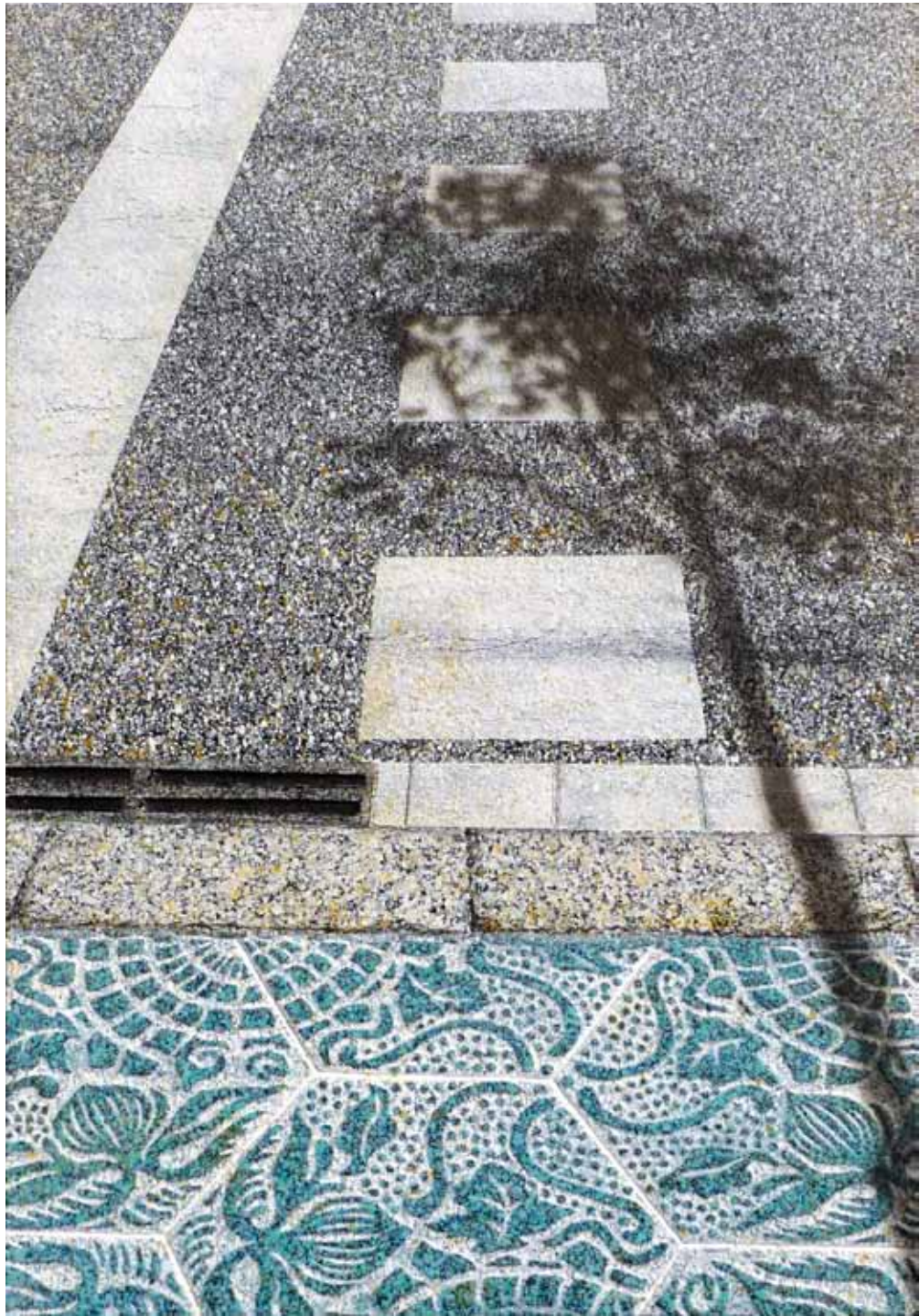
tree shadow 51 x 35" • mixed media on canvas