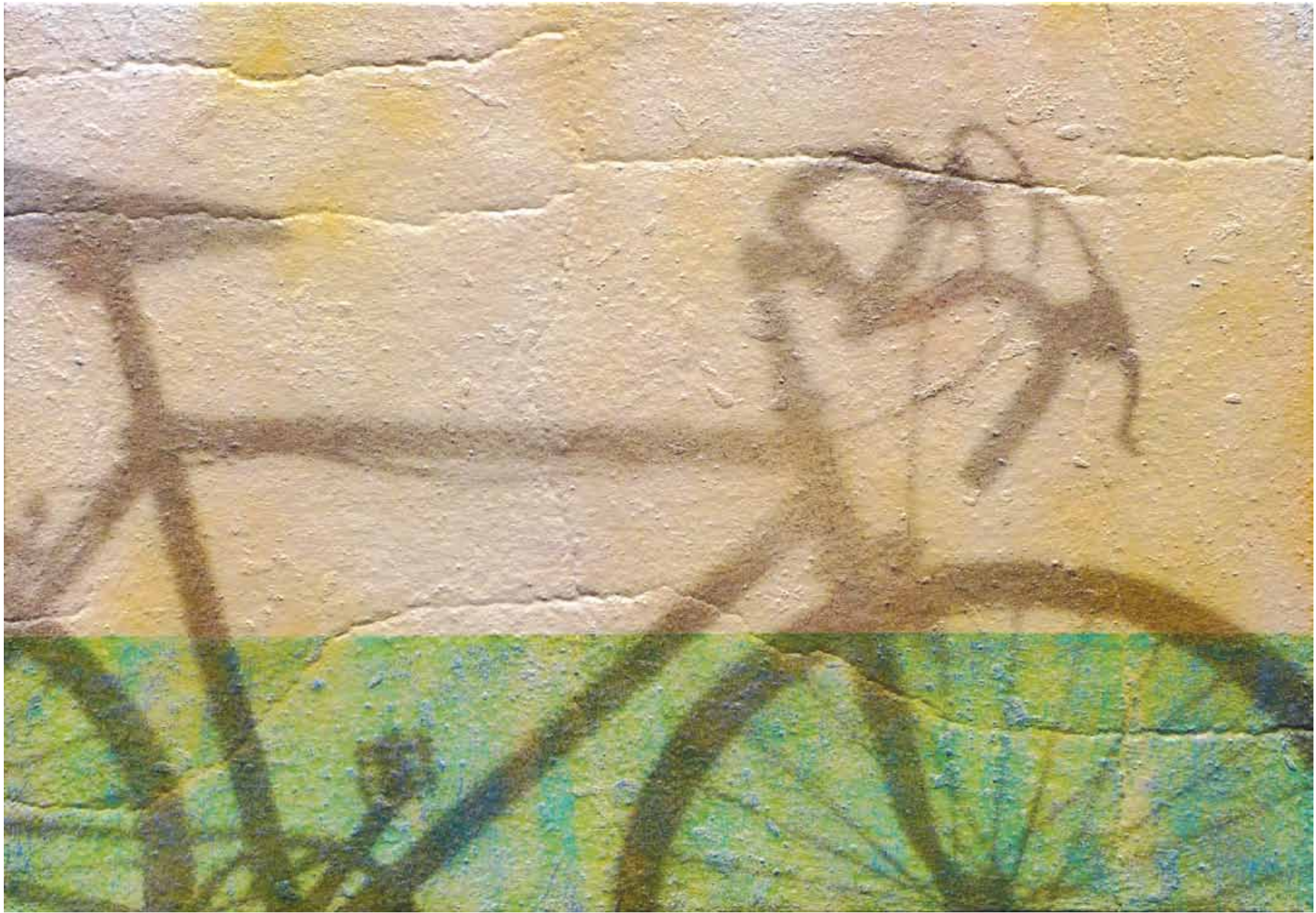
green fringe 32 x 46" • mixed media on canvas