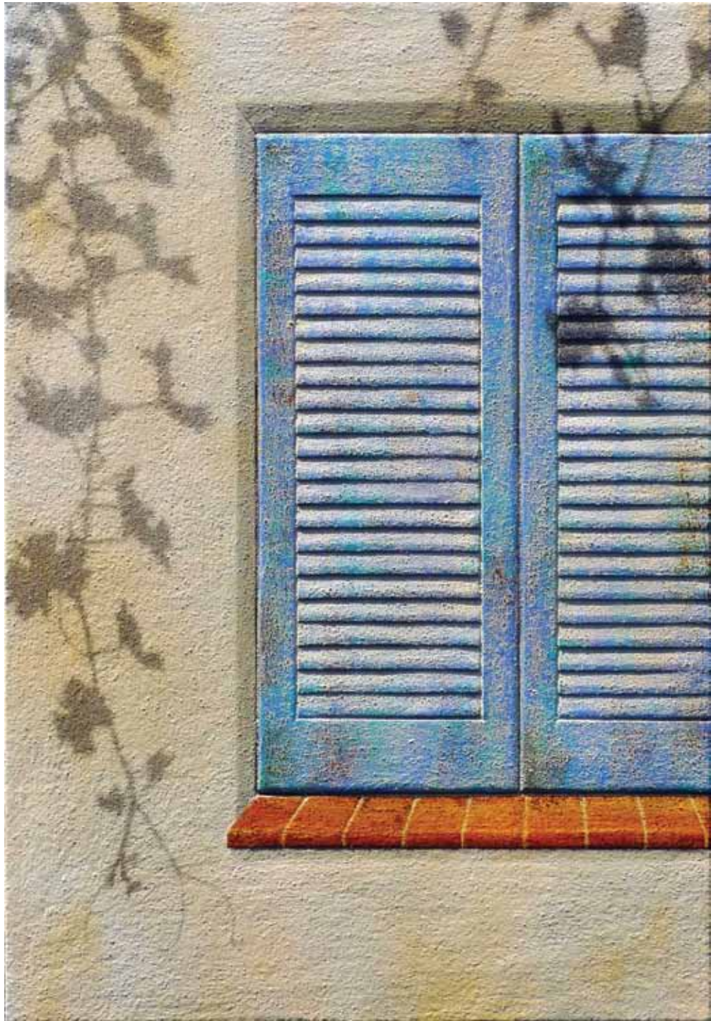
grapevine above 51 x 35" • mixed media on canvas