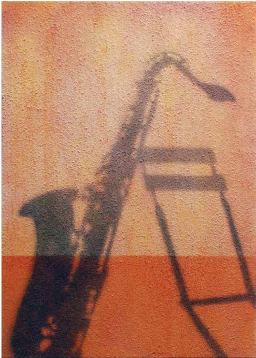
saxophone and chair 36 x 26" • mixed media on canvas